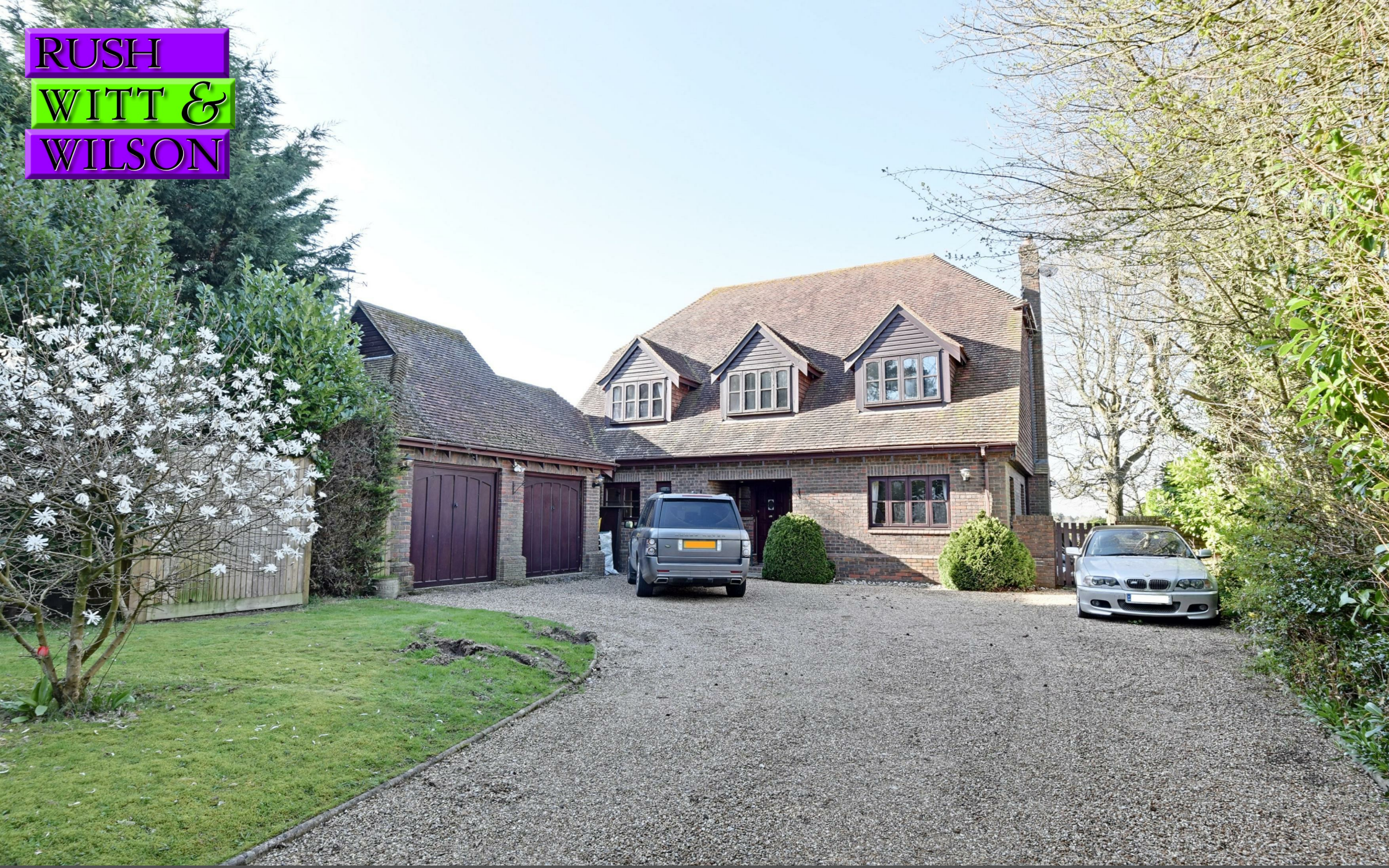
Woodstock House Tenterden Road, Rolvenden, Kent TN17 4NB Guide Price £995,000